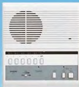
LEF-5 5-Call Master Station, surface mount