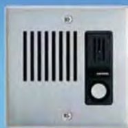
LE-DA* Door Station, stainless steel faceplate, flush mount, 2-gang