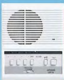
LEF-3L 3-Call Master Station with selective door release, surface mount