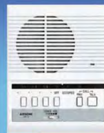
LEF-3 3-Call Master Station, surface mount