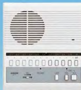
LEF-10 10-Call Master Station, surface mount