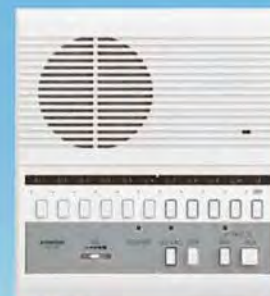
LEF-10S 10-Call Master Station with All Call, surface mount

*See back page for complete sub and door listing