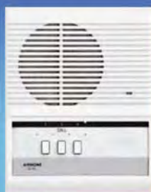
LE-A3* 3-Call Sub Station, surface mount