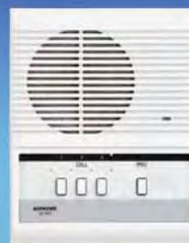
LE-AN3* 3-Call Privacy Sub Station, surface mount